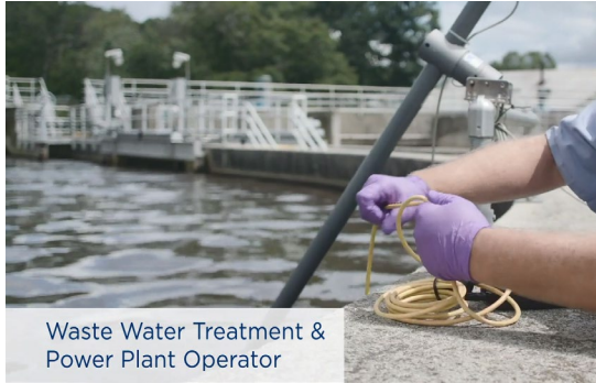
Waste Water Treatment & Power Plant Operator