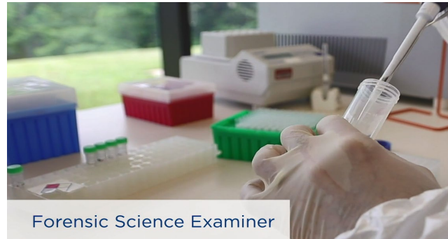
Forensic Science Examiner