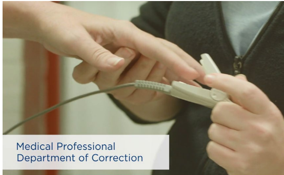
Medical Professional Department of Correction